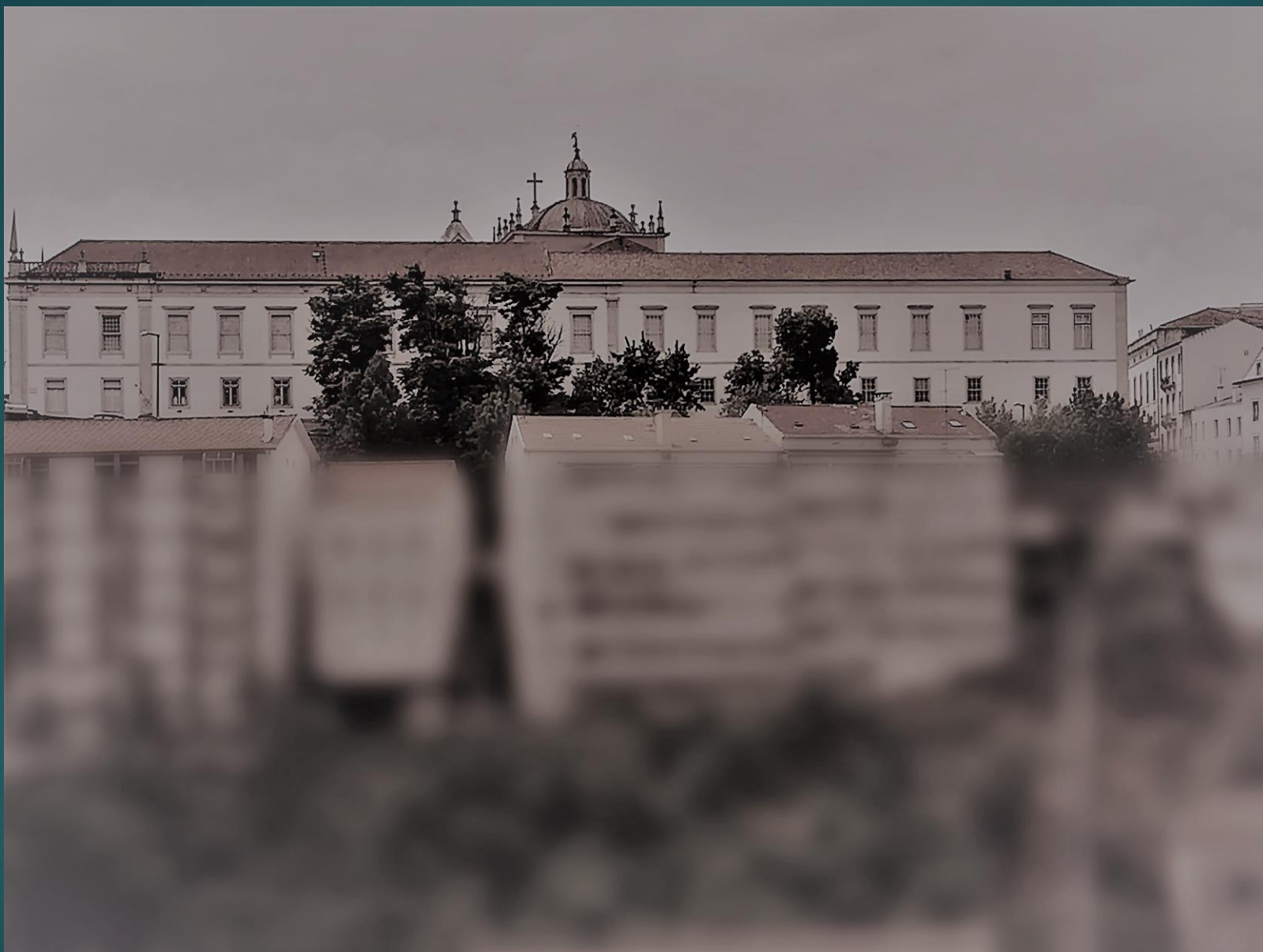
VIEW: New Cathedral of Coimbra (Sé Nova de Coimbra)